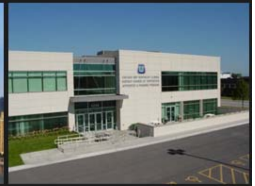
Chicago Regional Council of Carpenters Carpenter Training Center Elk Grove Village, Illinois