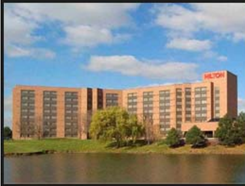
Hilton Lisle/Naperville Lisle, Illinois